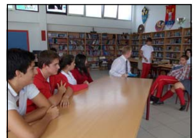
The debate in action