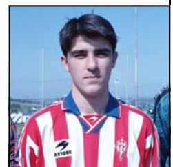
Legend Villa, at Gijón

Nel's next football match is going to be against la Corredoria.