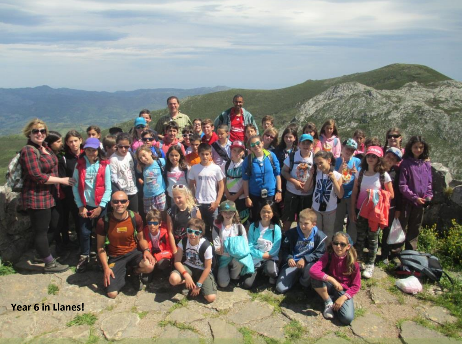
Year 6 in Llanes!